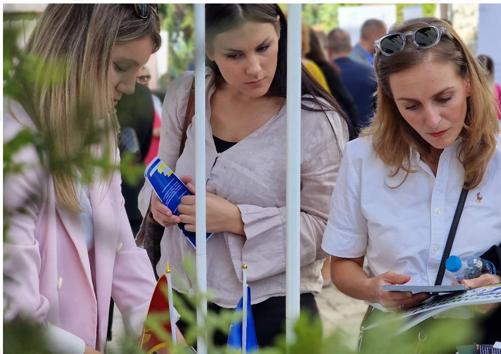
PHOTO CREDIT: EUROPEAN COOPERATION DAY IN PEJA – EU OFFICE IN KOSOVO