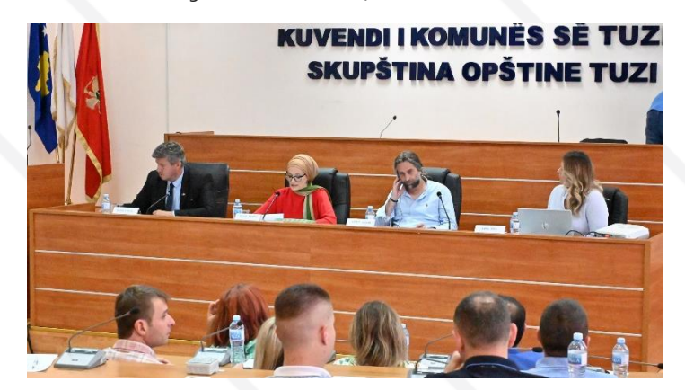
Follow the project <u>page</u> for more information.

The municipality of Tuzi, in partnership with the municipality of Peja, is implementing the project New Environment Revitalization Approach – NERA with a total value of 479,027.23 EUR. During 22 months of implementation, the project will contribute to environmental protection through a strategically oriented approach in local communities in Montenegro and Kosovo. The project focuses on strengthening the capacity of local actors to establish an efficient model of solid waste management in these municipalities based on citizens participatory approach. In order to mark the start of the project activities a press conference was organized in Tuzi on 27 June.