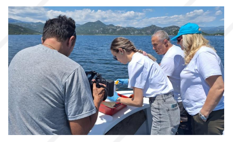
Capacity building activities for beneficiaries

With this project, over 60 beneficiaries gained new knowledge and received equipment to improve their own production, over 5,000 people were informed about this project through media presentation and about 30 people provided themselves with a permanent source of income and increased employment, while over 250 people participated in the