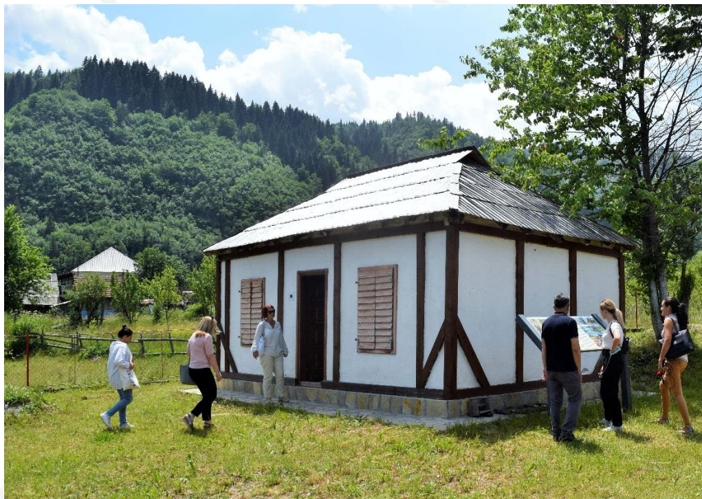
PHOTO CREDIT: ETNO ROOM LUBNICE (BERANE) - WORKSHOP WITH JOURNALISTS