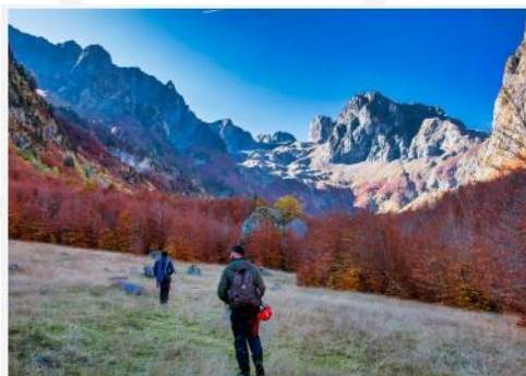
Grebaje valley.

Moreover, a seven-day itinerary, for all those who want to discover in a unique way some of the best-kept secrets of the cross-border area between Montenegro and Kosovo was also created. For more information click here .