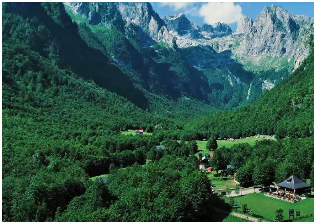
ECO AND OUTDOOR TOURISM ACTIONS OF THE BALKAN ALPS